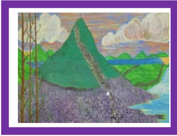
A House of Prayer for All Nations